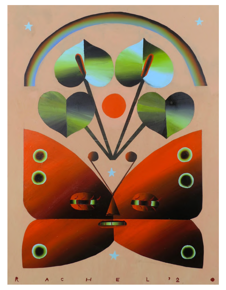
Moth in the Living Room (2020) Acrylic on wood panel, 24 x 18 in