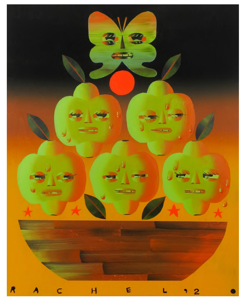
Five Lemons in a Sauna (2020) Acrylic on wood panel, 20 x 16 in