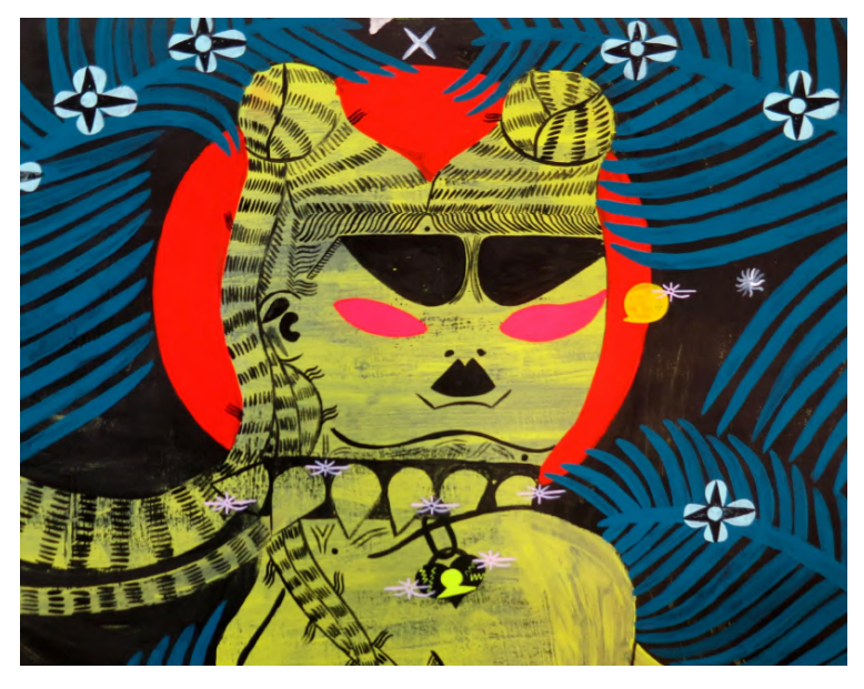
Born in 1989 in New York City, where she lives and works