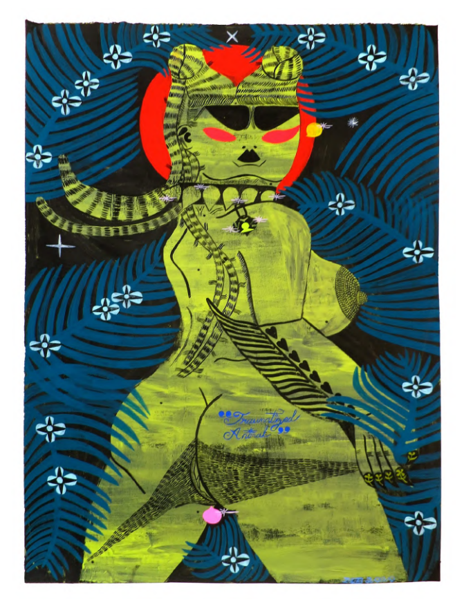
Traumatized animal (2020) Gouache and acrylic on paper, 20 x 15 in