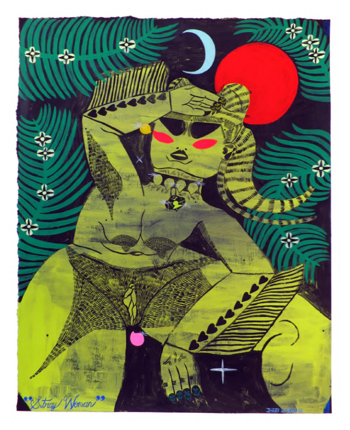
Stray woman (2020) Gouache and acrylic on paper, 20 x 16 in