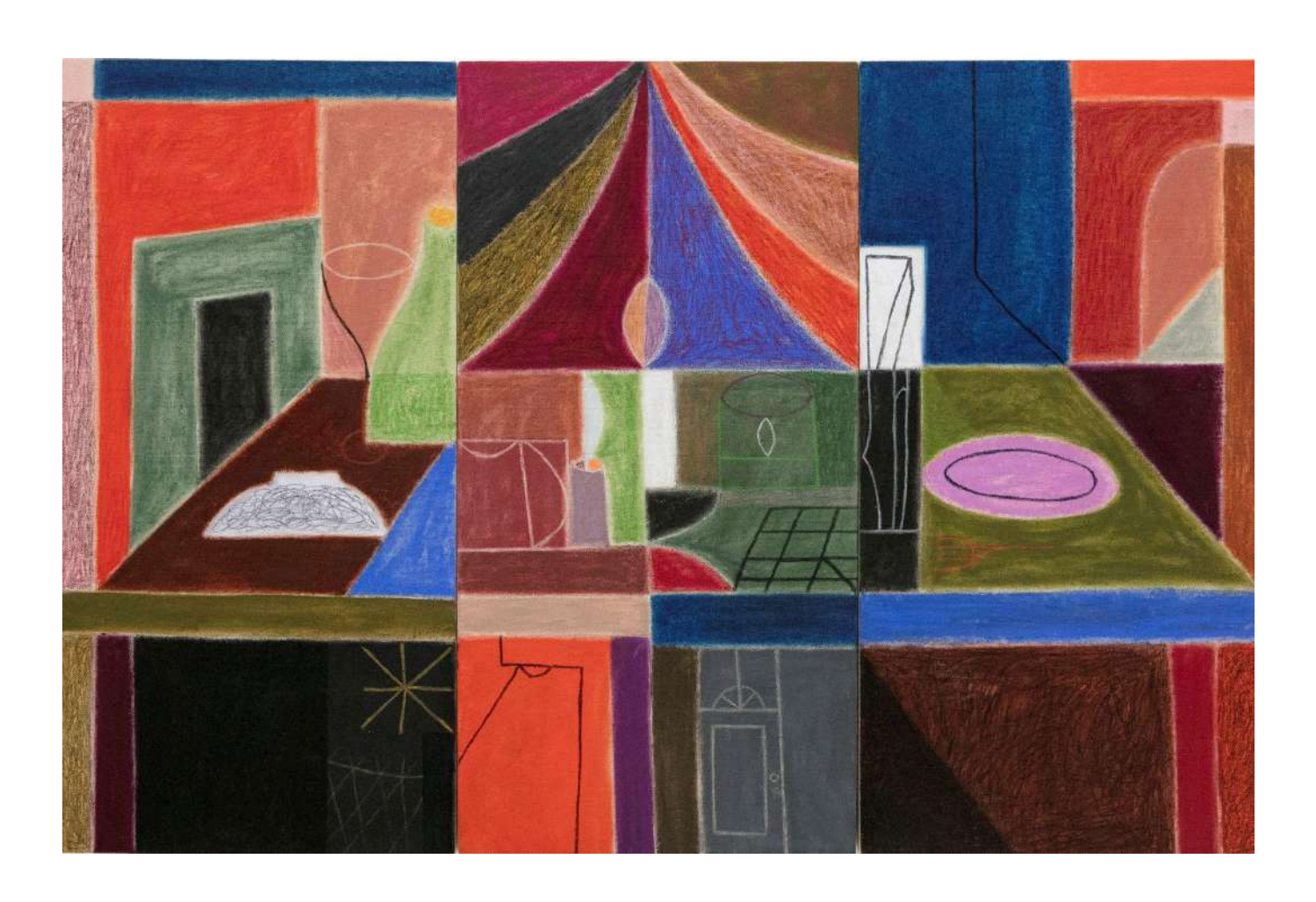
Two tables pushed together to make one big table (2021) Oil pastel on canvas, 24 x 36 in (triptych)

Oakland-based painter Muzae Sesay has shown widely since 2015, with dozens of solo and group exhibitions in the Bay Area as well as additional presentations in Los Angeles, New York, London and Copenhagen. Sesay's richly chromatic, geometrically structured works deftly allude to history, community, personal experience and the world around us. Much of his work explores the formation and fragmentation of memory, identity and human connection in relationship to environments and architectural spaces real and imagined.