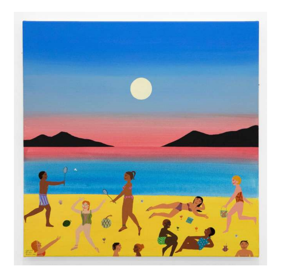
Badminton on the Beach (2021) Acrylic on canvas, 30 x 30 in

Across Wong's paintings, whether densely populated or sparse, a utopic sense of joy and acceptance emanates from her work. People of every imaginable background mix and mingle creating joyful scenarios devoid of prejudice or exclusion. Wong presents worlds that exist between the imaginary and real, a magical place that could be, not too far from reality.