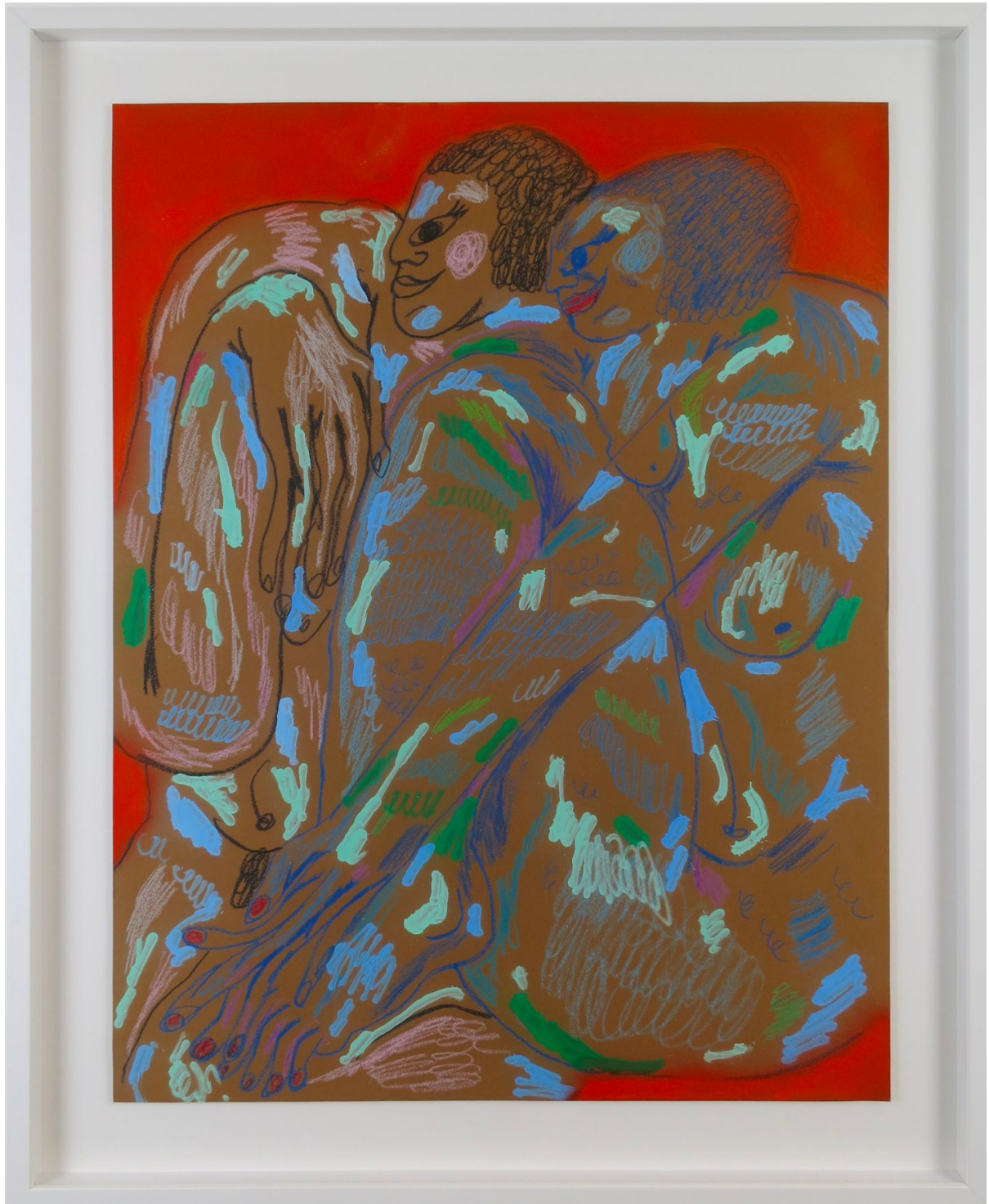
In the right place (2022) Acrylic airbrush and oil stick on paper

25 × 20 in / 65 × 50 cm 30 x 24 in / 75 x 60 cm (framed with a museum glass)