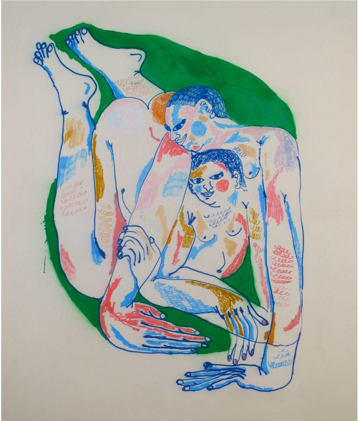
My weight on you (2022) Acrylic airbrush on canvas