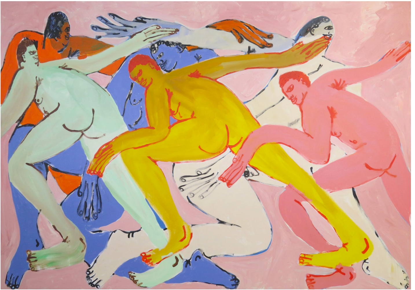
Let's go (2022) Acrylic on canvas