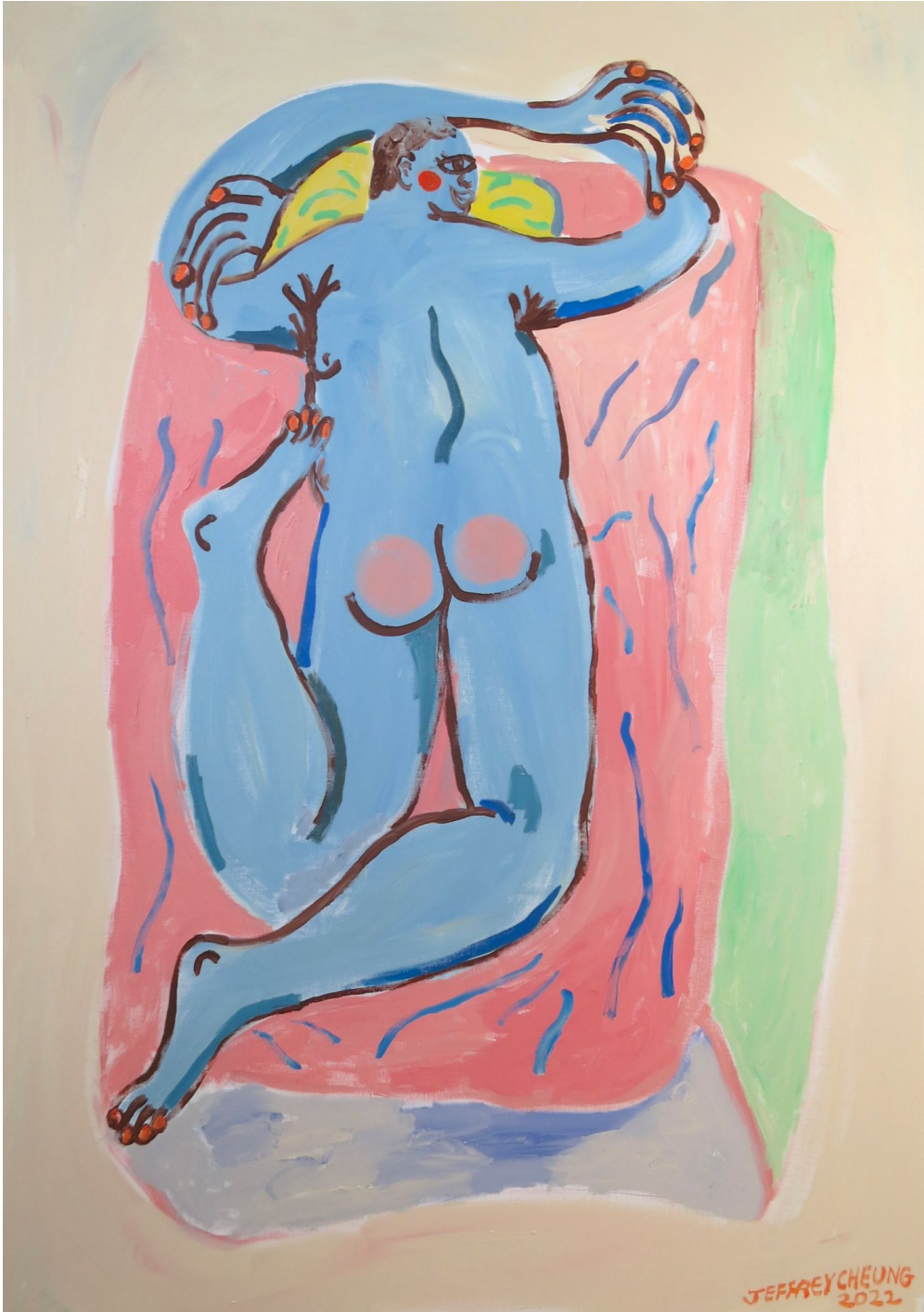
The door is open! And I've been horny my whole life (2022) Acrylic on canvas