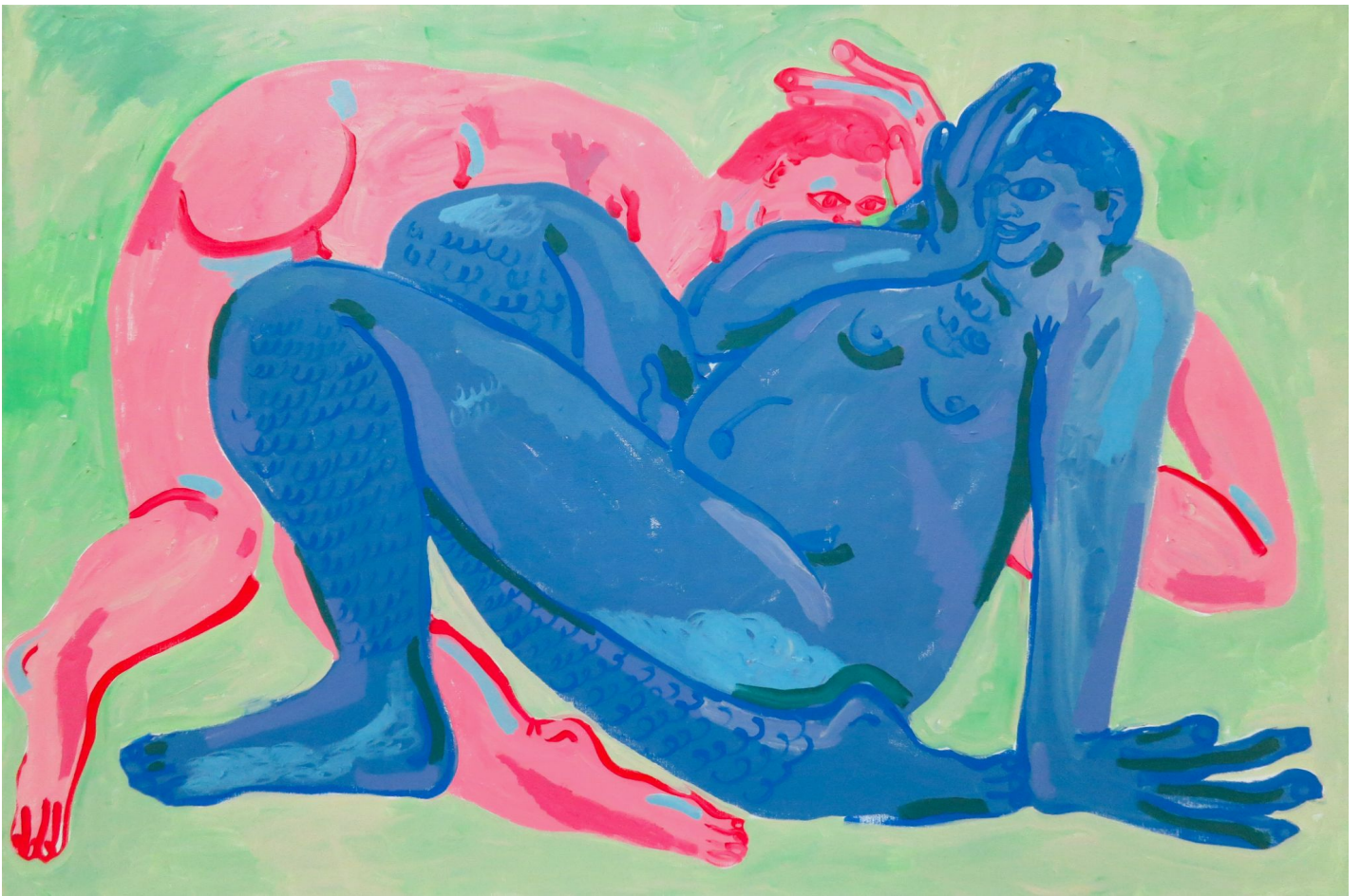
Tell me more (2022) Acrylic on canvas