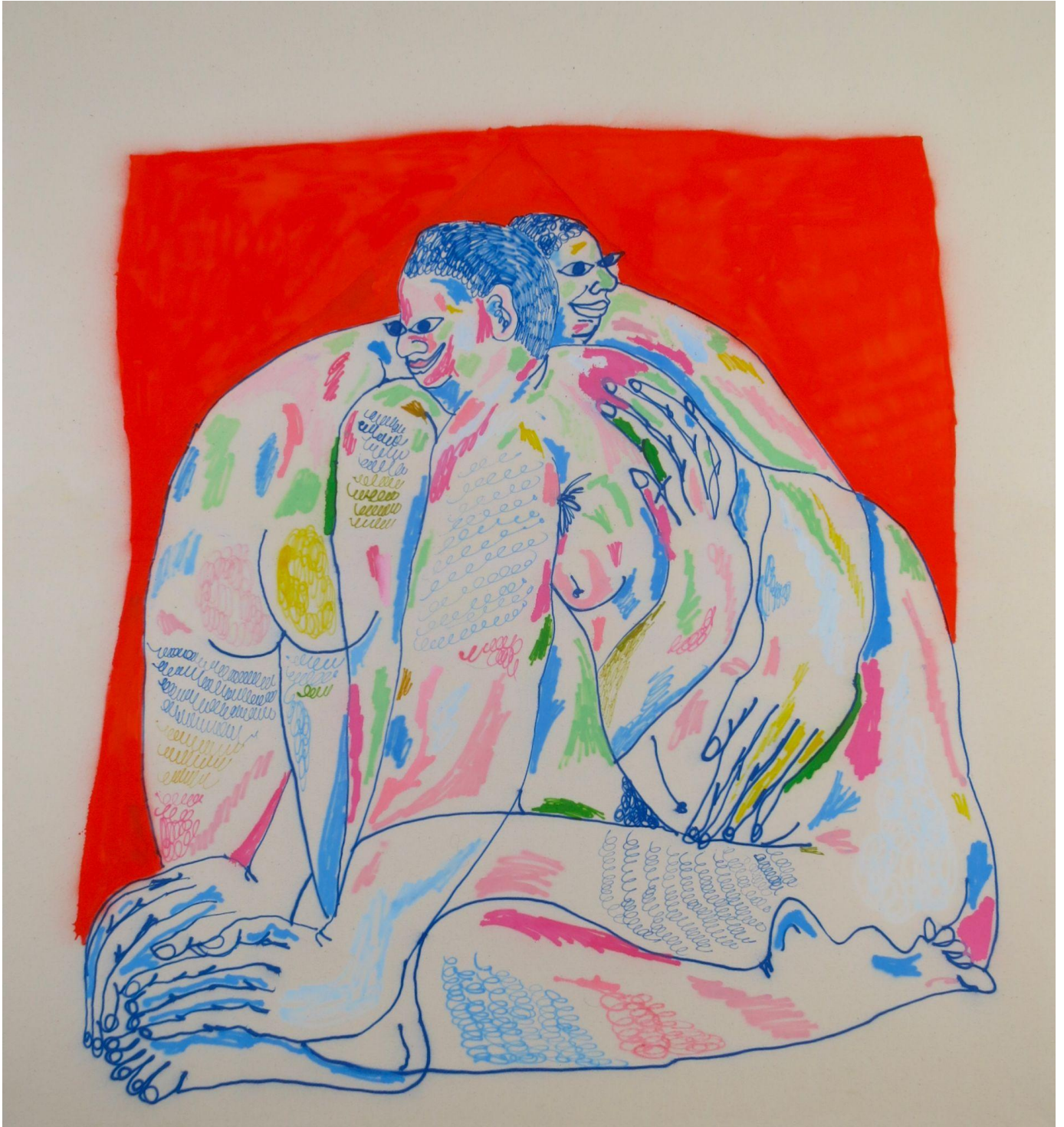
By your side (2022) Acrylic airbrush on canvas